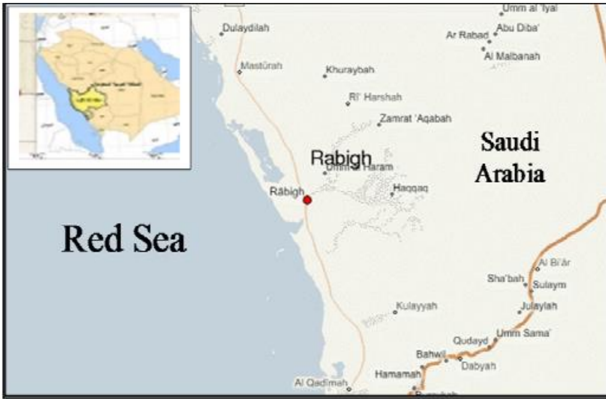
Fig. 1. Location map of the study site, Rabigh Governorate, West of Saudi Arabia

Atomic Absorption (AAS) and the Metrohm Ion Chromatograph.